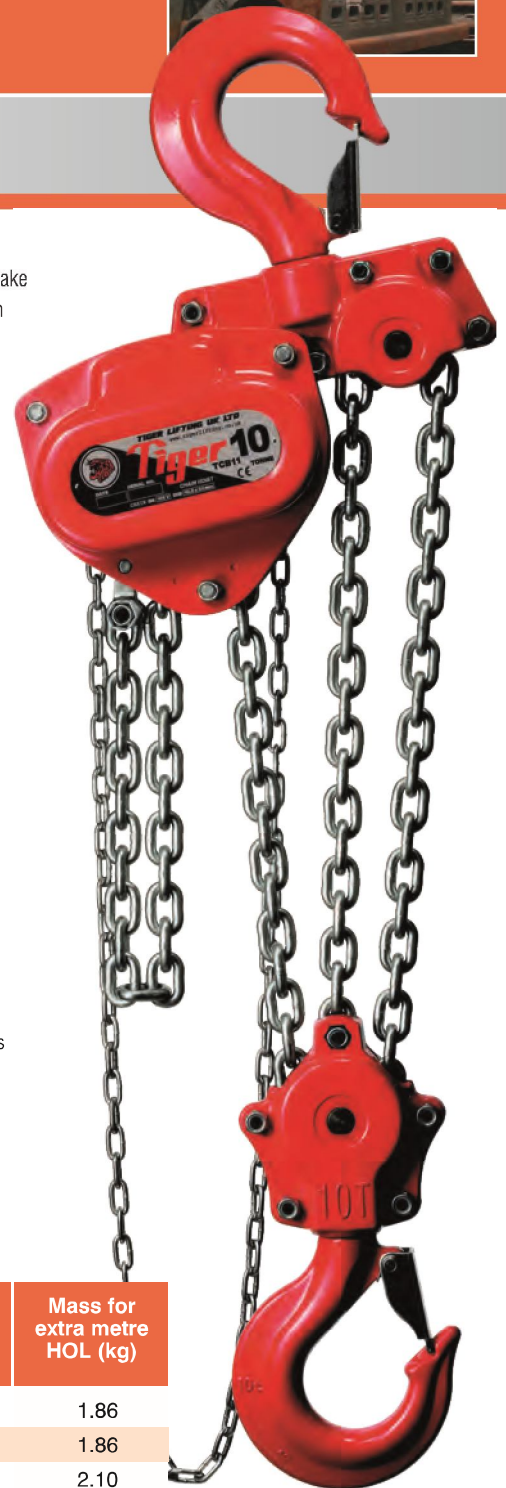
Shown with optional corrosion resistant load chain.

The fine tolerance deep pockets on the hand wheel ensure positive engagement of the hand chain at all times for smooth operation. Overload protection available.